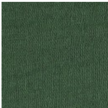
09959.042 DARK GREEN