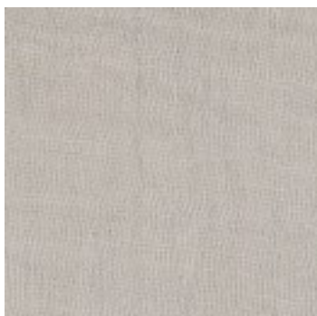
09959.045 LIGHT SAND