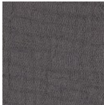
09959.002 DARK GREY