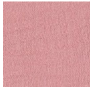
09959.007 OLD ROSE