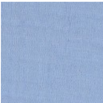
09959.055 LIGHT BLUE