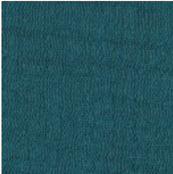
09959.052 DARK CYAN