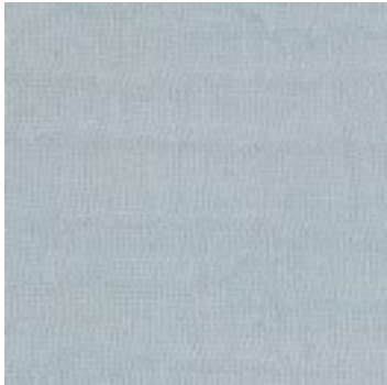
09959.053 BABY BLUE