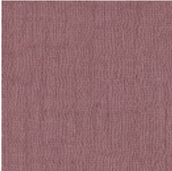
09959.049 LIGHT LILAC