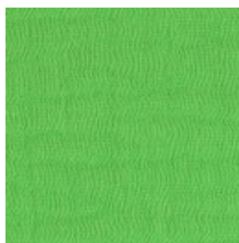
03959.069 LIME NEON