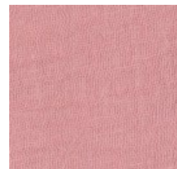
09959.007 OLD ROSE