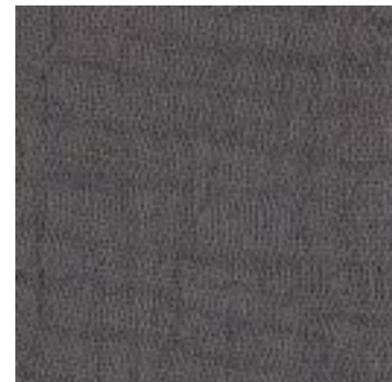
09959.002 DARK GREY