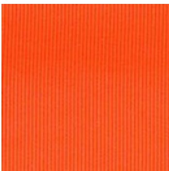
09992.004 NEON ORANGE