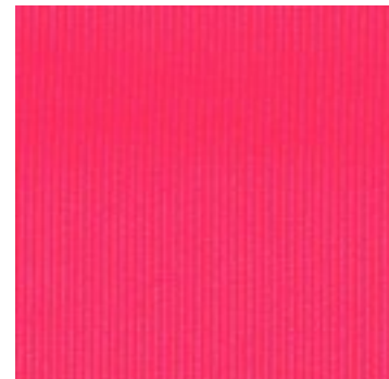
09992.002 NEON PINK