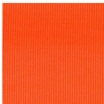
09992.004 NEON ORANGE