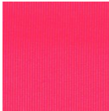
09992.002 NEON PINK