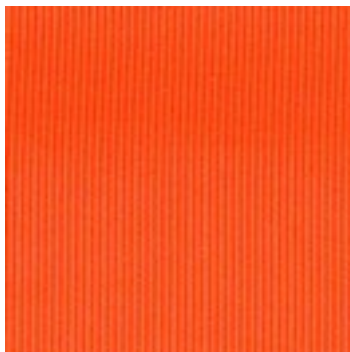
09992.004 NEON ORANGE