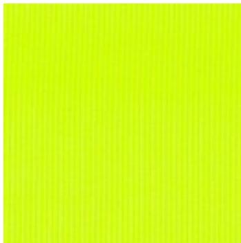
09992.001 NEON YELLOW