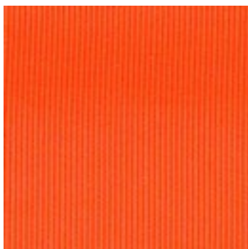
09992.004 NEON ORANGE