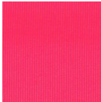
09992.002 NEON PINK