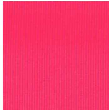
09992.002 NEON PINK