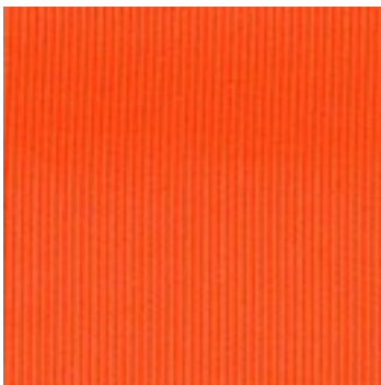
09992.004 NEON ORANGE