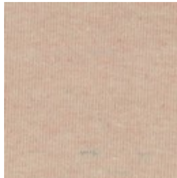
09989.011 LIGHT ROSE