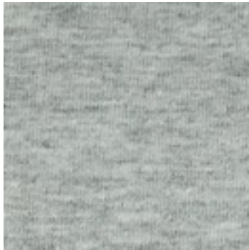
09989.004 CLOUD GREY