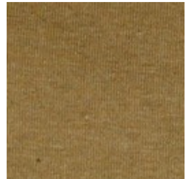
09989.014 LIGHT BROWN