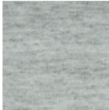
09989.005 LIGHT GREY