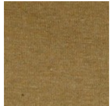
09989.014 LIGHT BROWN