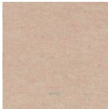
09989.011 LIGHT ROSE