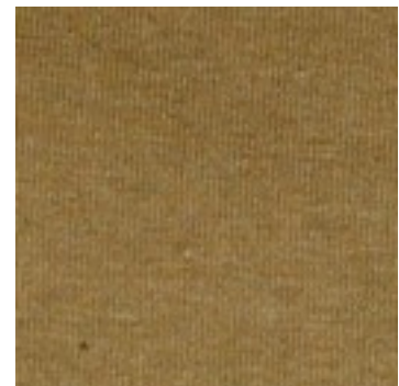
09989.014 LIGHT BROWN