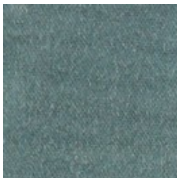
09744.007 ROCK GREY