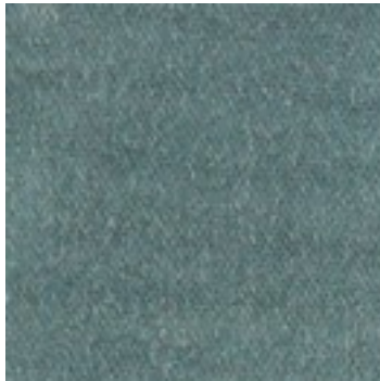
09744.007 ROCK GREY