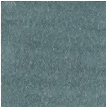
09744.007 ROCK GREY