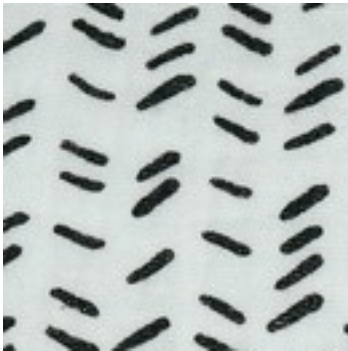
09794.010 OFF WHITE