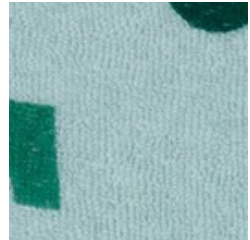
09581.006 OLD BLUE