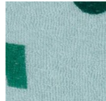
09581.006 OLD BLUE