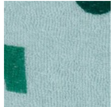
09581.006 OLD BLUE