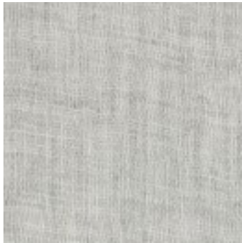
09716.001 ECRU MELANGE