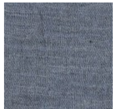
09716.011 JEANS MELANGE