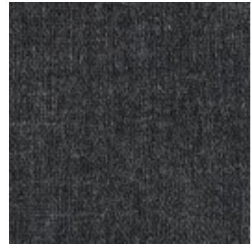
09716.003 DARK GREY MELANGE