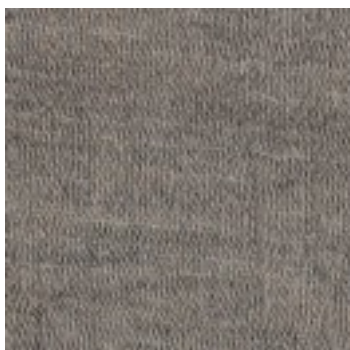
09716.007 TAUPE MELANGE