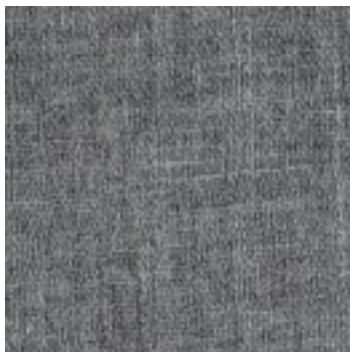
09716.004 GREY MELANGE