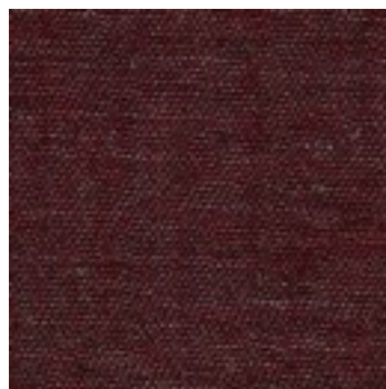
09716.010 BERRY MELANGE