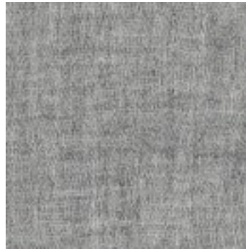
09716.002 LIGHT GREY MELANGE