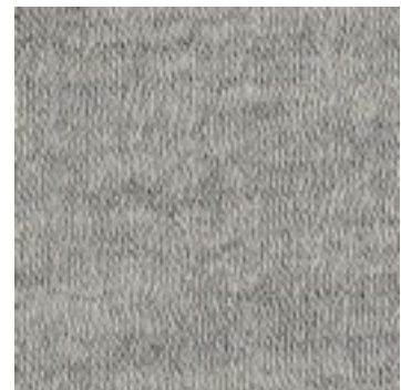
09716.006 SAND MELANGE