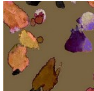
09978.007 LIGHT BROWN