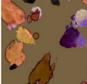
09978.007 LIGHT BROWN