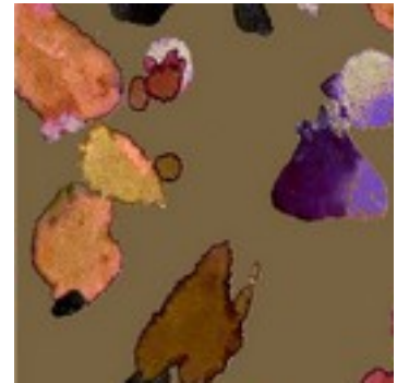
09978.007 LIGHT BROWN