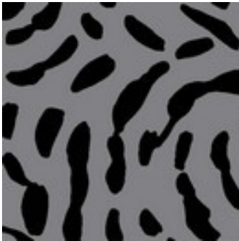
09851.003 ROCK GREY