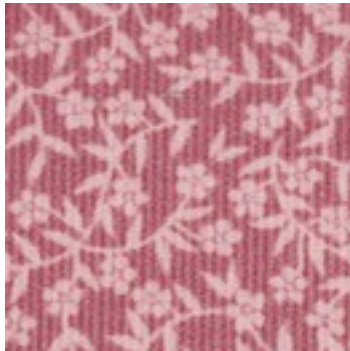
09803.001 OLD BLUSH