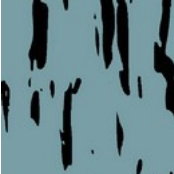
09851.119 LIGHT TURQUOISE