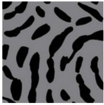
09851.003 ROCK GREY