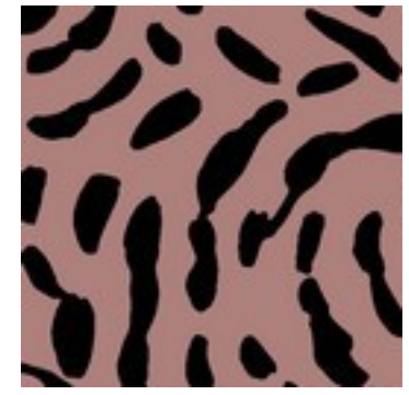
09851.010 OLD ROSE