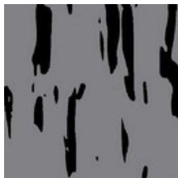
09851.103 ROCK GREY