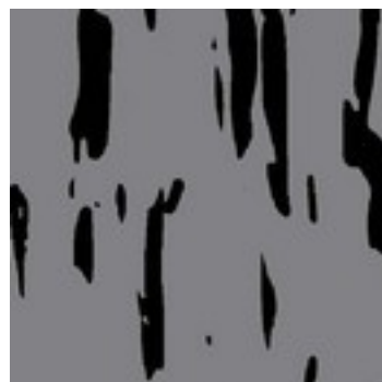
09851.103 ROCK GREY