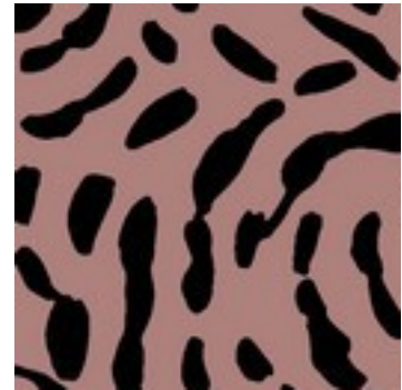
09851.010 OLD ROSE