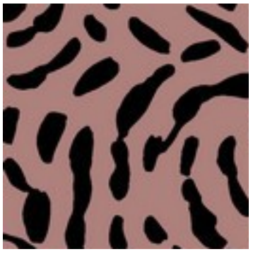
09851.010 OLD ROSE