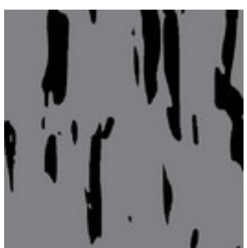
09851.103 ROCK GREY