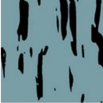
09851.119 LIGHT TURQUOISE