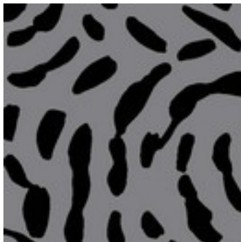
09851.003 ROCK GREY