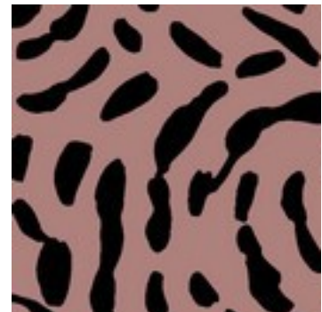
09851.010 OLD ROSE