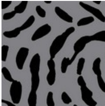
09851.003 ROCK GREY