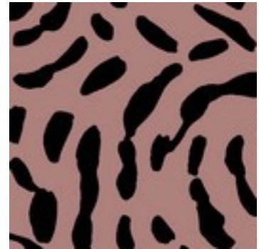
09851.010 OLD ROSE