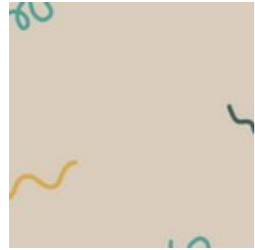
09923.015 LIGHT SAND