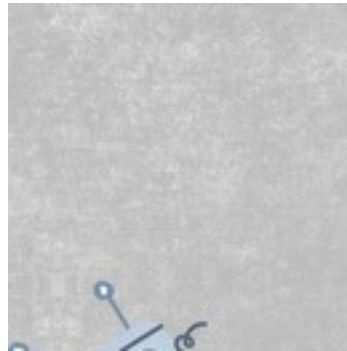
09834.003 LIGHT GREY