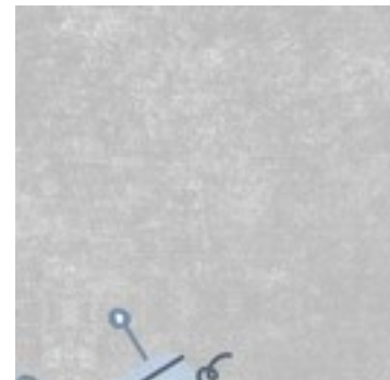
09834.003 LIGHT GREY