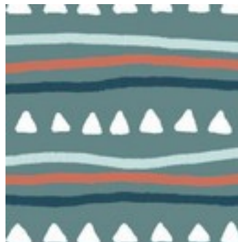
09935.018 BLUE SHADOW