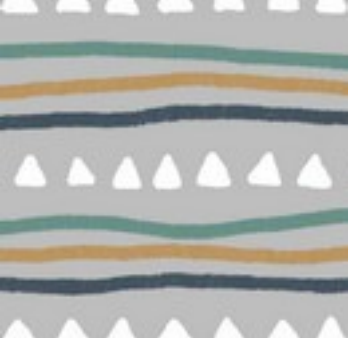
09935.014 LIGHT GREY