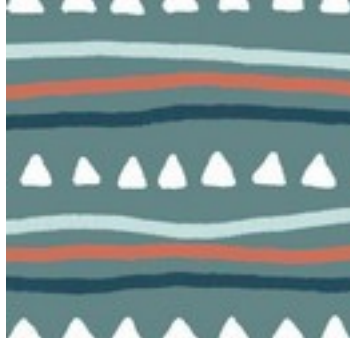
09935.018 BLUE SHADOW