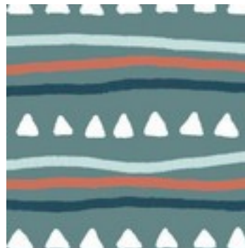
09935.018 BLUE SHADOW