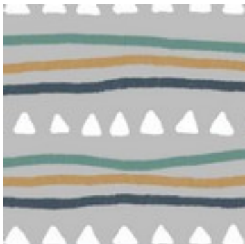
09935.014 LIGHT GREY