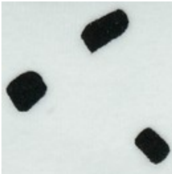
09822.002 OFF WHITE