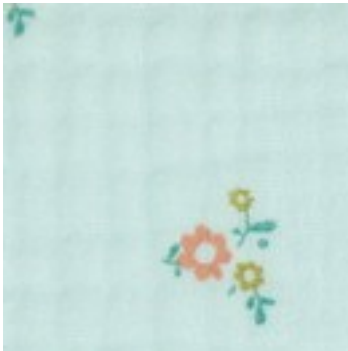
05489.046 LIGHT MINT