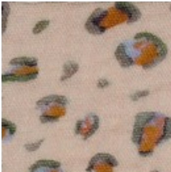
09738.003 LIGHT ROSE