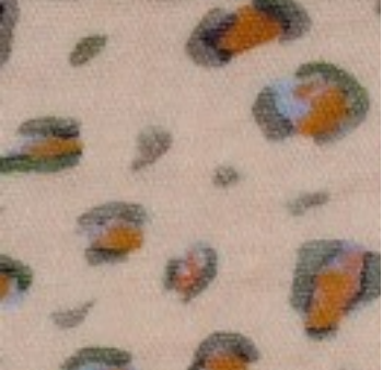
09738.003 LIGHT ROSE