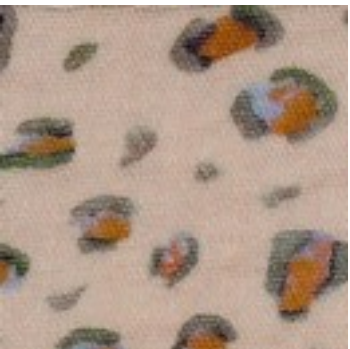
09738.003 LIGHT ROSE