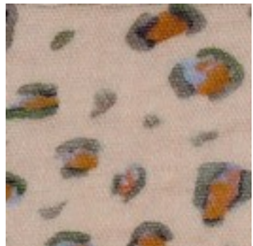
09738.003 LIGHT ROSE