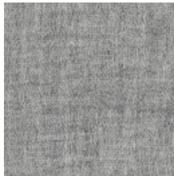
09716.002 LIGHT GREY MELANGE