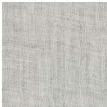
09716.001 ECRU MELANGE