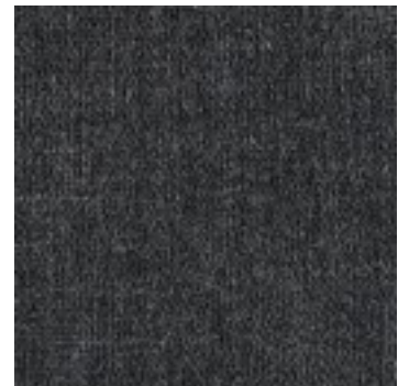
09716.003 DARK GREY MELANGE