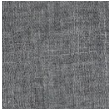
09716.004 GREY MELANGE