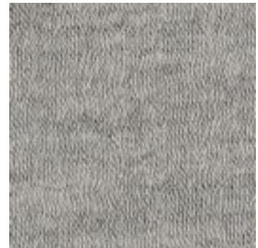
09716.006 SAND MELANGE