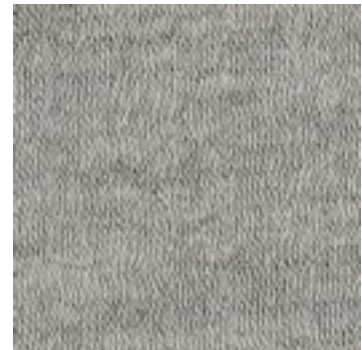
09716.006 SAND MELANGE