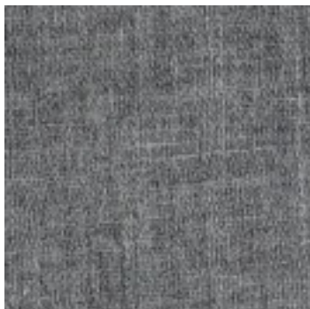
09716.004 GREY MELANGE