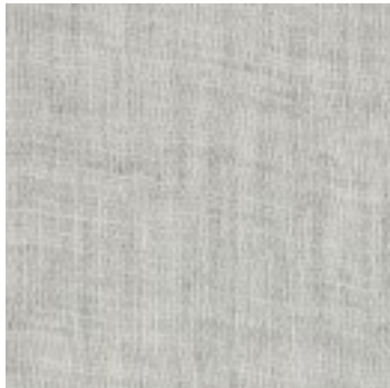
09716.001 ECRU MELANGE