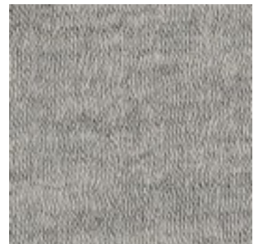
09716.006 SAND MELANGE