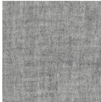
09716.002 LIGHT GREY MELANGE