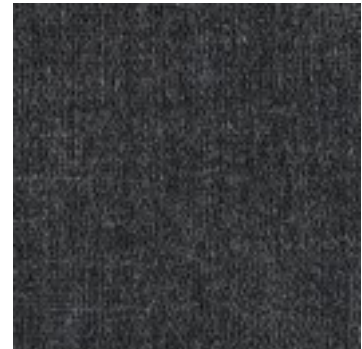
09716.003 DARK GREY MELANGE