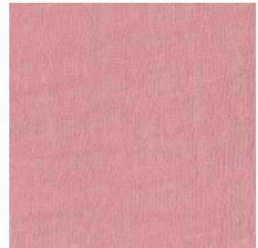
09959.007 OLD ROSE